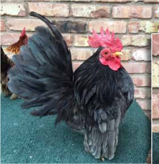
Blues photographed January 2014 randomly at Jerry's place for this article, no posing.