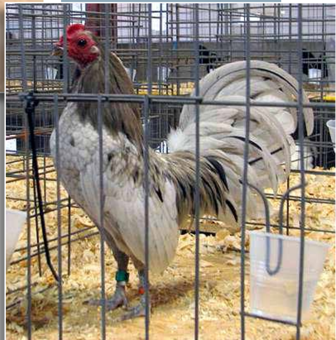
Right: Splash OEGB from SunnyChick Florida (Newman Show).