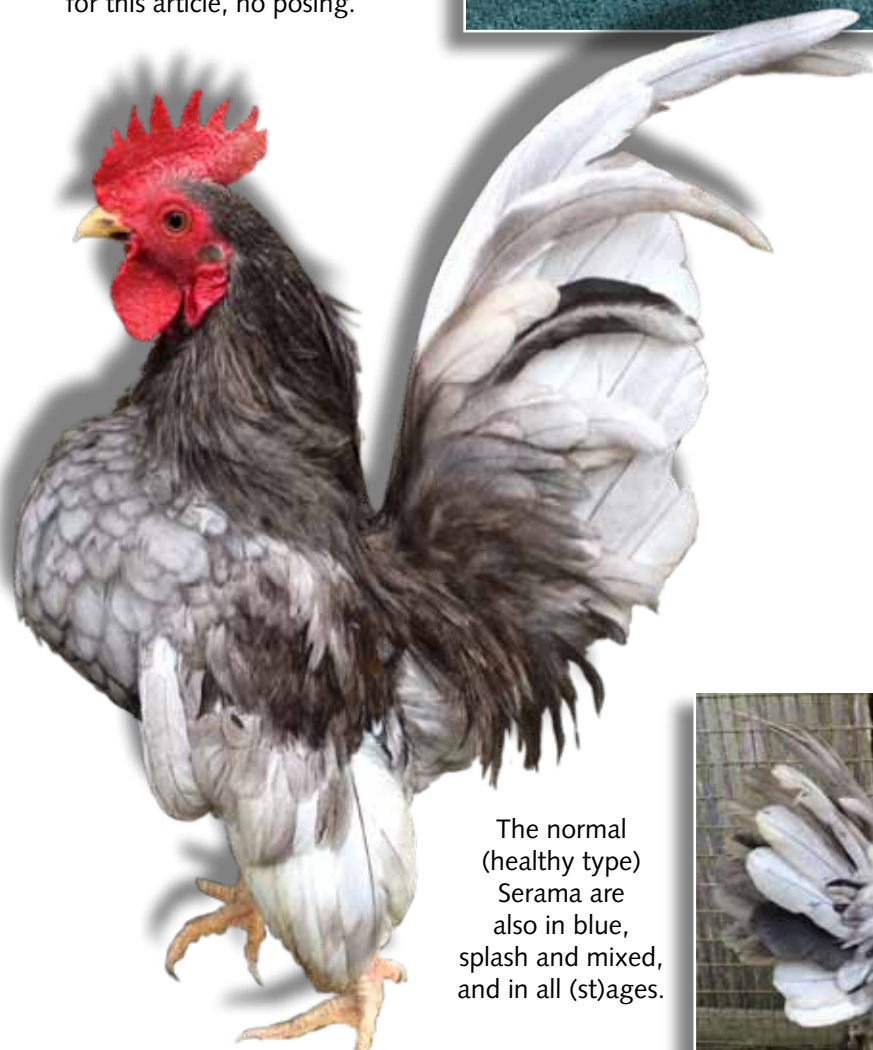
The normal (healthy type) Serama are also in blue, splash and mixed, and in all (st)ages.