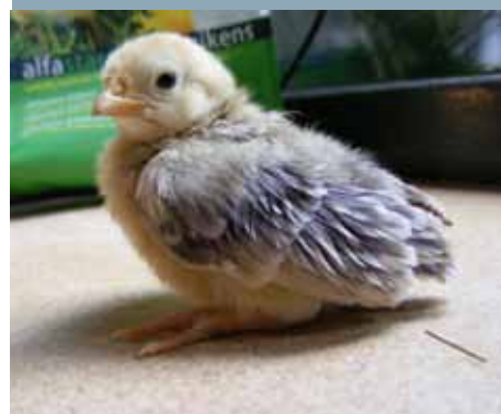
Blue cuckoo Serama chick.

Its easier to breed a bad pure Serama than a mix which looks like a Serama.