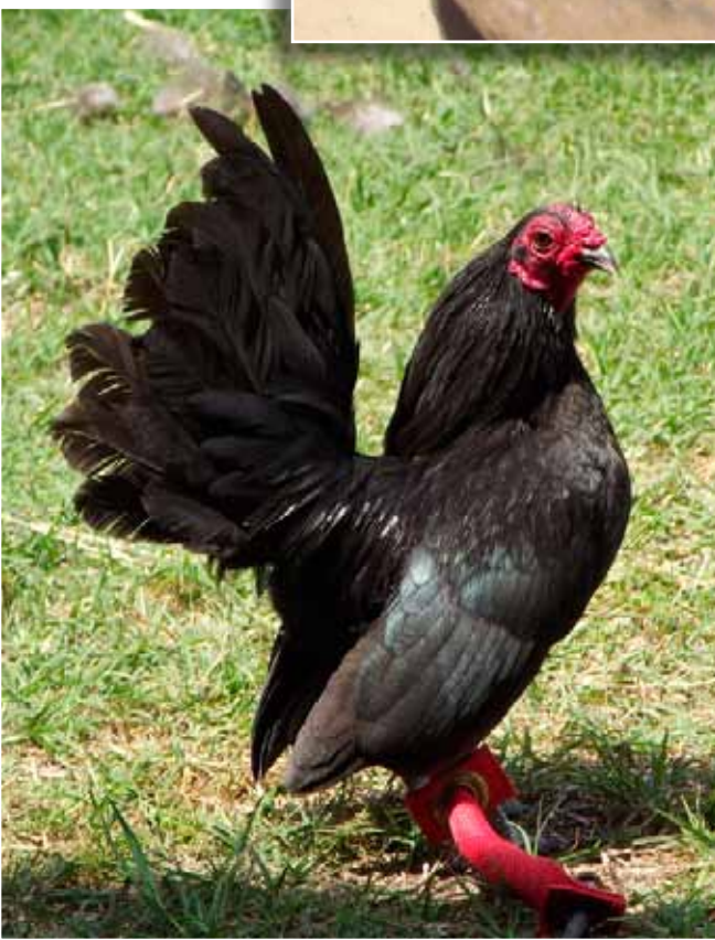
Left: Black OEGB from Soda Bottle Seramas Georgia.