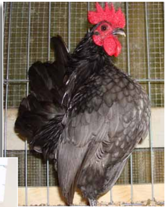
Blueboy, a show winner in 2007 from Jerry, look at the large eye, short wings and good feather quality.

All blue Serama descending from my birds, also the culls which went to France till the end of 2009 are OEGB mixes in the 6th, 7th, 8th and 9th back cross to Serama. Actually its easier to breed a bad pure Serama than to mix to Japanese or Dutch Bantams... why do the effort if there are enough bad pure Serama out there?