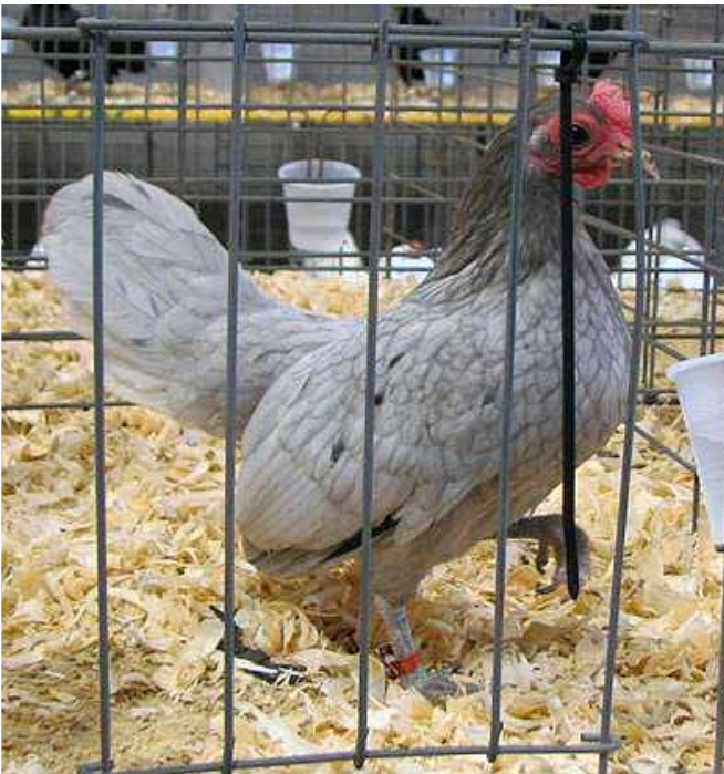
Splash OEGB hen from SunnyChick Florida.