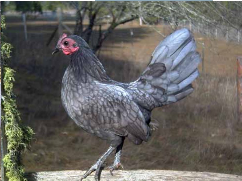
Magical photo of the blue OEGB hen Stacy